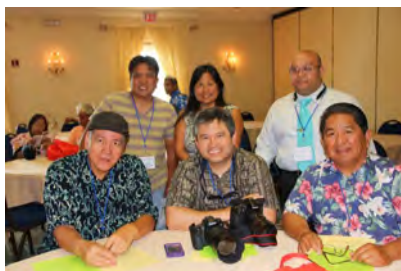
FANHS Board Members and Trustees