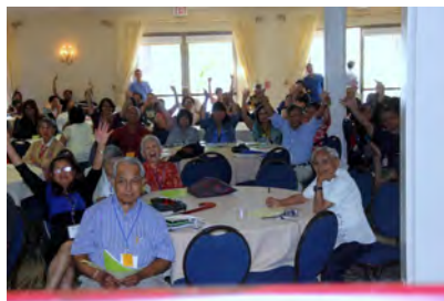
Delegates from throughout the U.S.