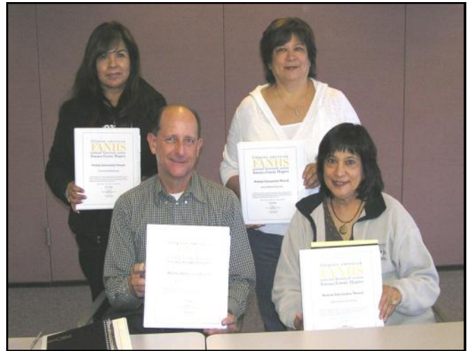
On May 11, several FANHS members received webmaster training for the chapter's new website.