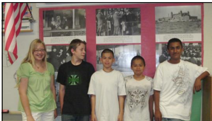
Students from 8 th grade Social Studies class, Lodi Middle School, Lodi, CA, May 2009

If you would like to share our film with your organization or institution, please visit our website, www.fanhssonoma.org , and send us an email.