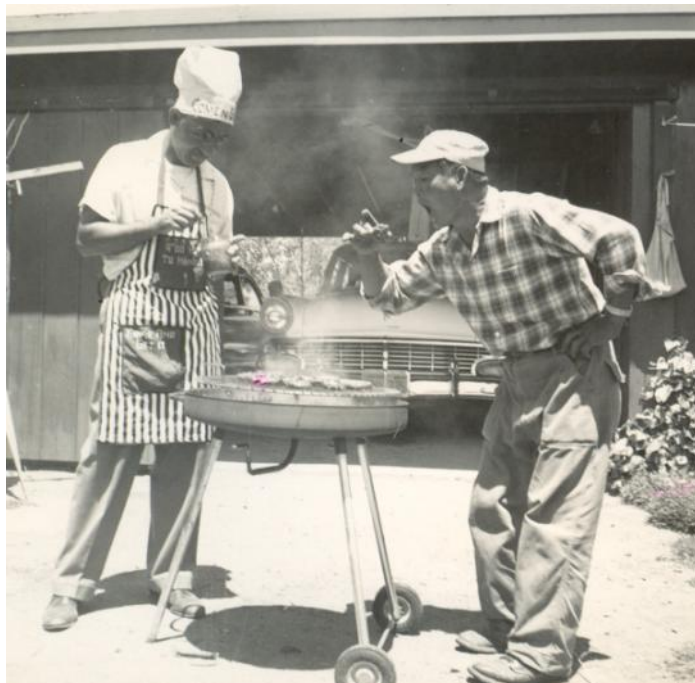
"Heated" Discussion Over BBQ. Conversants unknown. Circa 1959